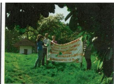
"I share my garden"